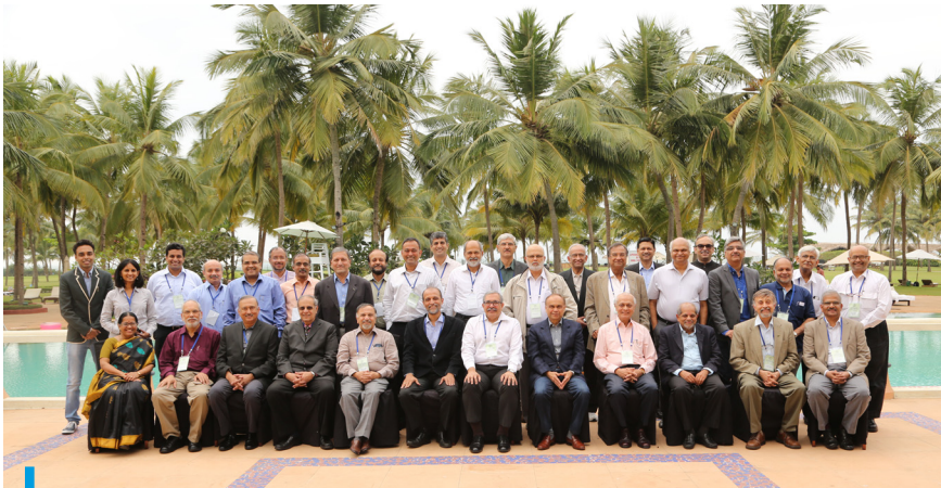
FAN and DAM Meet at Goa.

The FAN and DAM meet was held in Goa during January 16- 17, 2016. Annual Distinguished Alumni Meet is an initiative that brings together IITB's distinguished alumni who have contributed and have been acknowledged for their distinguished services to the society at large. The meet is held annually to plan the strategic growth of the institution in the future years. This event is preceded by Faculty Alumni Network India Symposium where established and early stage researchers in certain identified research areas meet the IITB alumni from the