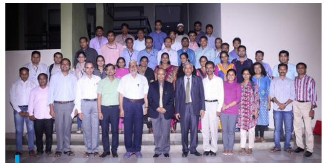
Ph.D Consortium 2015