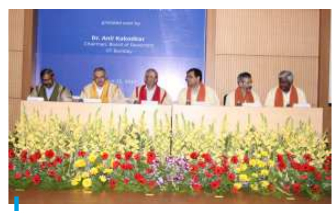
Dignatories on the Dais during the Interim Convocation Ceremony

Degrees were awarded to 58 Ph.D. students of IIT Bombay, on successful completion of their doctoral programmes at the Interim Convocation ceremony held in the Institute on March 11, 2015. Among the 58 Ph.D. students 31 were present to take their Degrees.