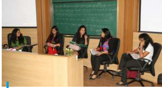
Students performing play during Women's Day Celebration

still have a Women Cell who looks into any matter that concerns the safety of girls on the campus because that is of utmost importance to us. The number of girl students at IIT Bombay is increasing every year but same can't be said about women faculty members. There is a strong need to increase women faculty in the Institute and hopefully we will be able to do it." Earlier, as a part of the celebration a small play by students - "Just a little...chit-chat" was performed midst deafening cheers.