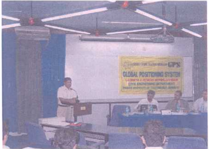
Session in progress at GPS - 2007

The topics included The Global Positioning System and Its Applications, GPS Meteorology, Introduction to Ionospheric studies, Modeling of Ionospheric Time Delay for GPS Applications, Introduction to Map Projections, Earthquake studies in Himalaya using GPS, Principles of GIS, GRAM++ GIS Package Development and Applications, Introduction to Surveying, GAGAN an Overview, etc. and field work for GPS Data collection & processing.