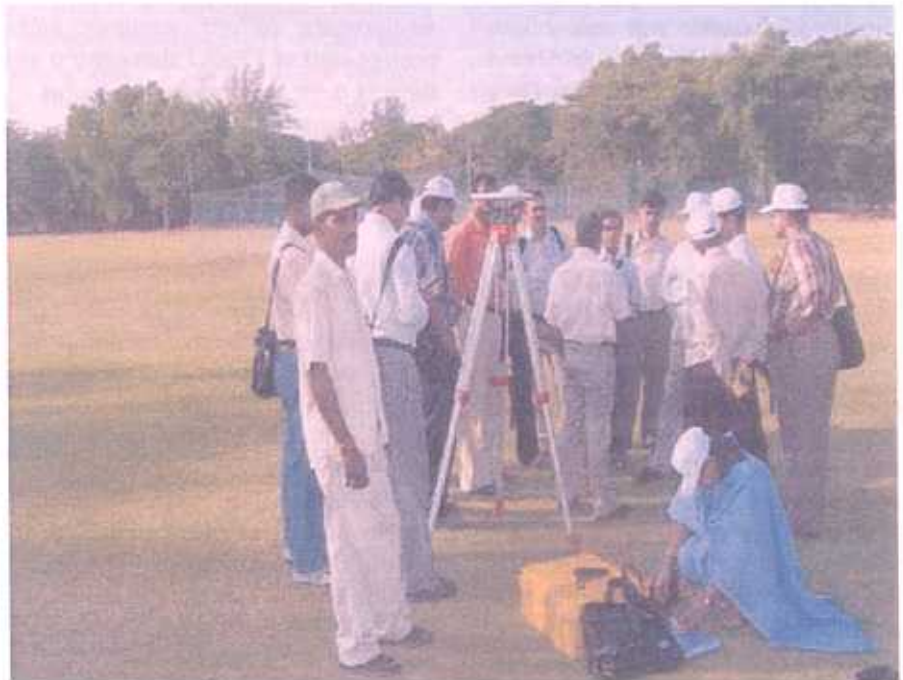
Participants at GPS - 2007 on field visit

Universities, and Institutes participated in the course. A Training Volume and a Compact Disk, both containing lecture notes, were provided to the participants.